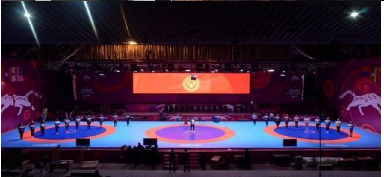
This is the view of the competition venue